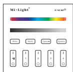
B3 / T3