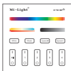
B4 / T4